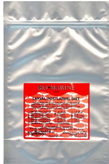
ABM P. vannamei

*Real colours of the shrimp hatchery feeds & bags would be different due to display condition.