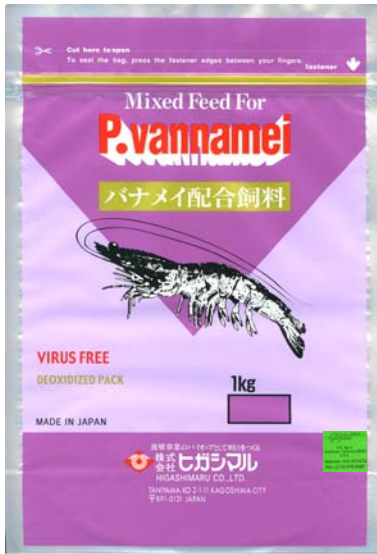
HIGASHIMARU P. vannamei

Keep feed fortified for grower Post Larval shrimps! Significantly high larvae production stability!!